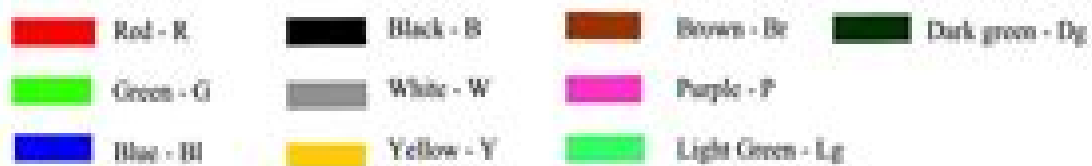
WIRING DIAGRAM—R.H.D. (Commencing Car No. ZB18577)