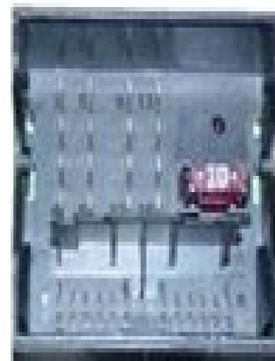
BMW CD Audio Connector