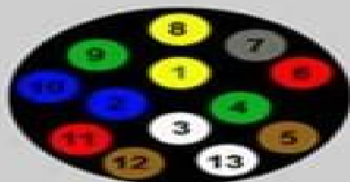
13 pin Euro plug