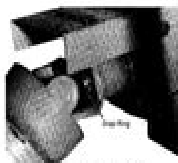
Figure 1 Snap Ring Location