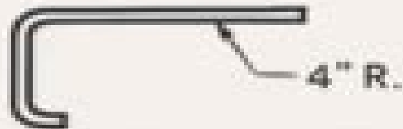
TYP. REBAR BEND