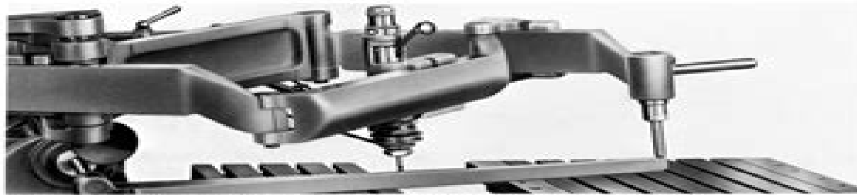
Fig 4 Aligning cutter and tracer pin with straightedge attachment