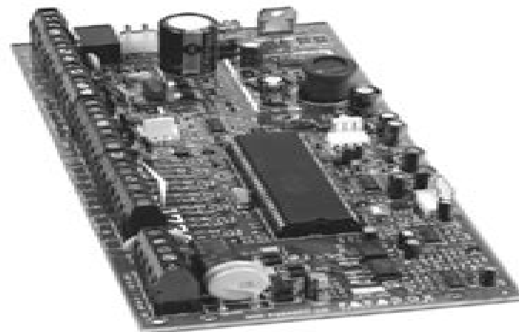
1738EX and 1738