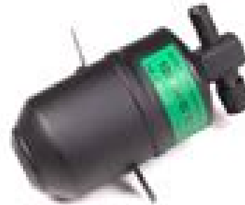
RECEIVER DRIER (ACCUMULATOR)