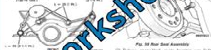
Fig. 38 Oil Pump Assembly

1. 10mm (3/8 in.) WRENCH 10mm (3/8 in.) WRENCH (10mm (3/8 in.))