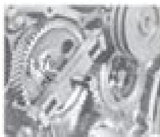
Fig. 50: Removing the crankshaft gear