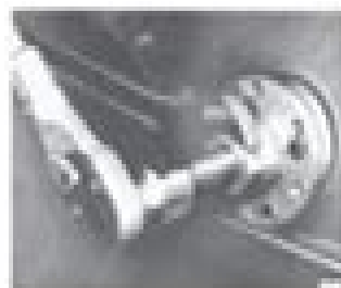
Fig. 49: Removing the pulley hub