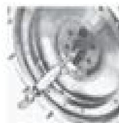
Fig. 52: Removing the flywheel bearing