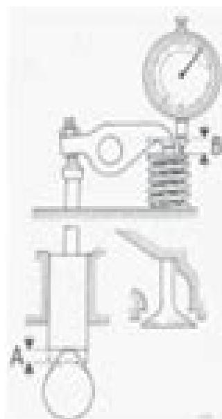
Fig. 48: Checking the crankshaft