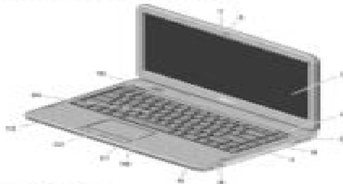
Figure 1. Front/Back

Front View Back View Vostro 1440/1540/1450/1550