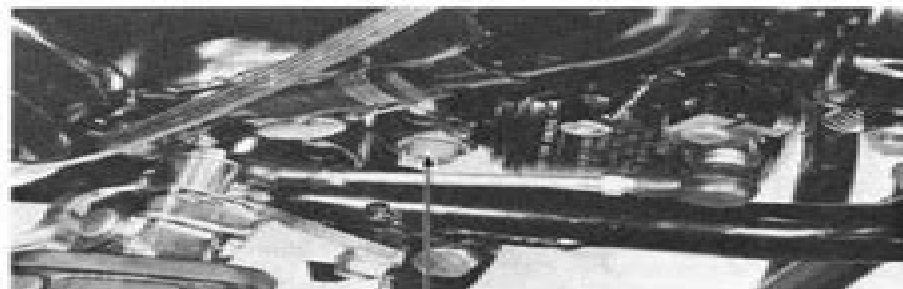
(1) OIL PRESSURE SWITCH (1) OIL PRESSURE GAUGE 07506-3000000 OIL PRESSURE GAUGE ATTACHMENT 07510-3000100

Remove the oil pump by removing the mounting bolts.