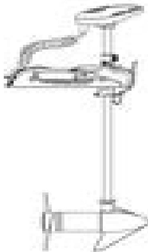
POWERDRIVE V2 BOW-MOUNT TROLLING MOTOR 1550T (15.5 HP)