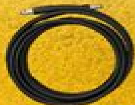
HIGH PRESSURE HOSE