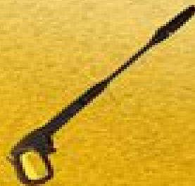
GUN W/ ADJUSTABLE NOZZLE