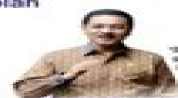
MENDAGRI Periode 2009-2014 Dr. H. Gamawan Fauzi, SH, M.M.