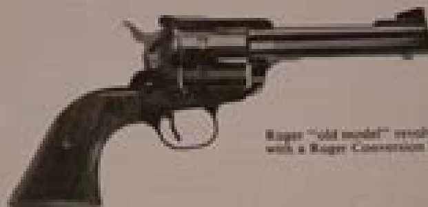
Ruger "old model" revolver equipped with a Ruger Conversion Kit

Single-Six • Blackhawk • Super Blackhawk