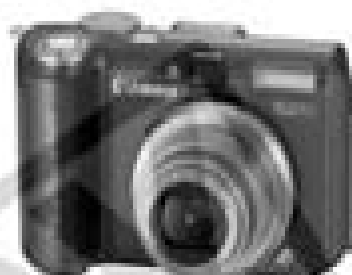
Photo of PowerShot A640