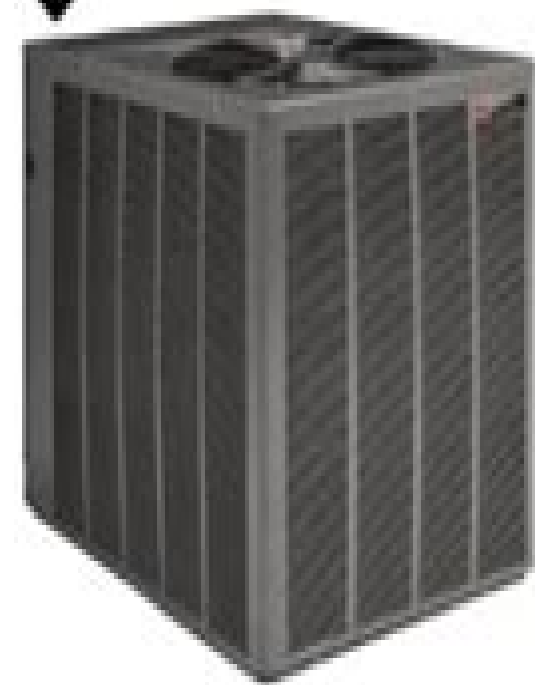
OUTDOOR UNIT (AIR CONDITIONER/HEAT PUMP)