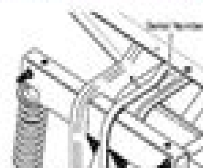
Fig. 2 Serial Number on Front Frame