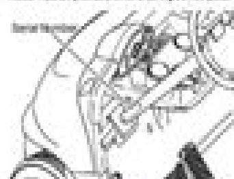
Fig. 1 Serial Number Location on Steering Column

In order to obtain correct components for the vehicle, the manufacture date code, serial number and vehicle model must be provided when ordering service parts.