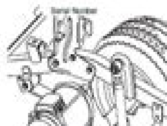
Fig. 3 Serial Number on Rear Frame

Before a new vehicle is put into operation, the items shown in the factory delivery checklist must be performed (Ref. Fig. 4).