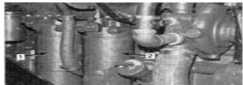
Figure 62: L10 Cummins

1- By-Pass Oil Filter 2- Full Flow Filter