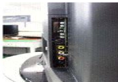
Board with missing plastic cover

Note: Consult the Samsung Service Website at ( www.service.samsungportal.com ) for the Service Manual and other information on this produ