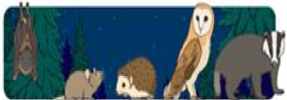
Bats mice hedgehogs owls badgers

Carry out your own research project into nocturnal animals and be ready to present your ideas to the class! You could find out about: