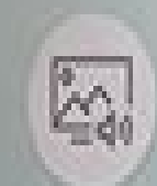
Picture and Sound