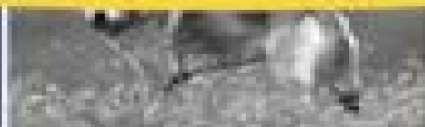
Engaged - Suspended or Suspended?