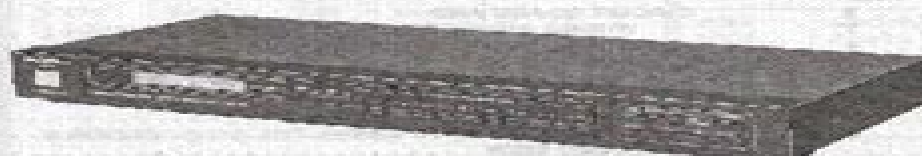
* This photo is ST-500.