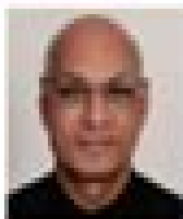
Shri. Ramesh Bais Hon'ble Chancellor