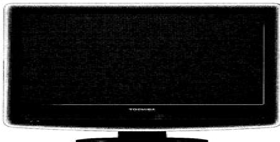
Illustration of 19LV505

©2006 Toshiba Corporation Before operating the unit, please read this manual thoroughly. *Screen size is approximate.