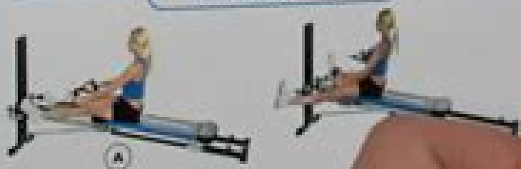
7. Outer Hip & Thigh