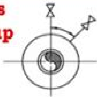
HORIZONTAL TAPS ORIENTATION (GAS/VAPOR)