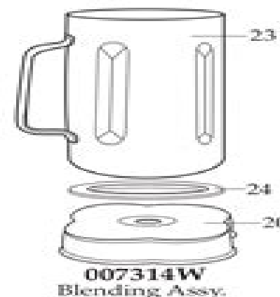
007314W Blending Assy. 500757 Container with Blending Assy. 500750 Container with Blending Assy. and Lid