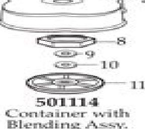
501114 Container with Blending Assy.