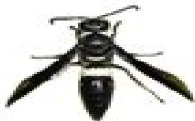
Four-Toothed Mason Wasp