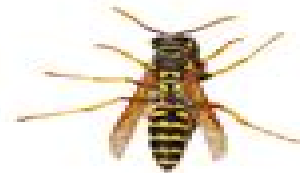
European Paper Wasp