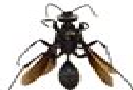
Great Black Wasp