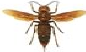
Asian Giant Hornet