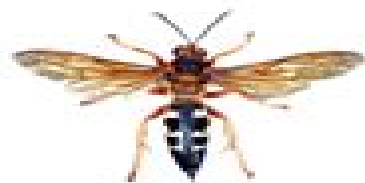
Cicada Killer Wasp