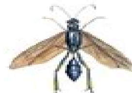
Common Blue Mud Dauber Wasp