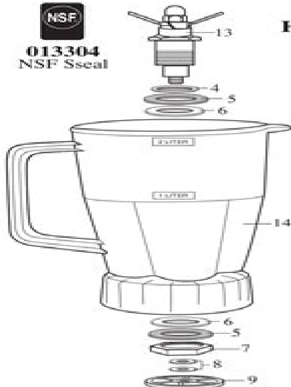
503120 - Blending Assy. Kit 502370 - Blending Assy. (older units)