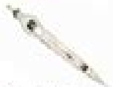
Phantom midge larva