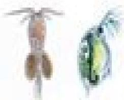
Water fleas (hydra and daphnia)