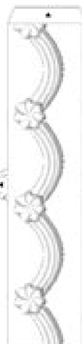
● Support C