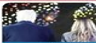
Trump tariffs likely to adversely impact Namibia Page 7