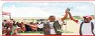
Swapo returns Guinea Page 3