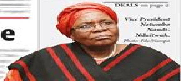
Vice President Netumbo Nandi- Ndaitwah.