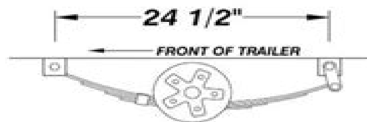
TYPICAL SUSPENSION ASSEMBLY