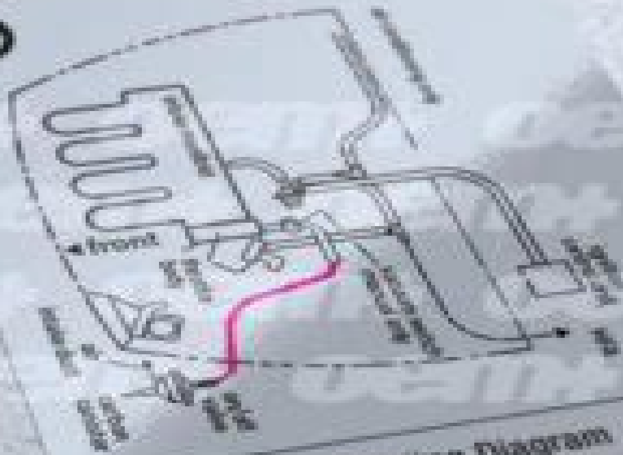
Vacuum Hose Routing Diagram 027 000 363 404