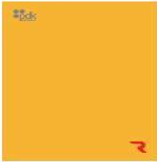
Red 2 Two Door Controller (1)