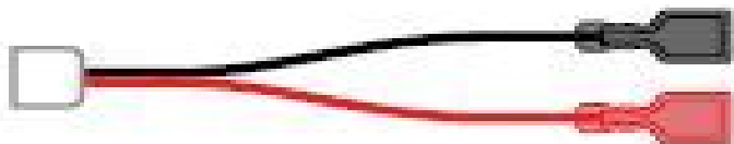
Battery Leads (1)