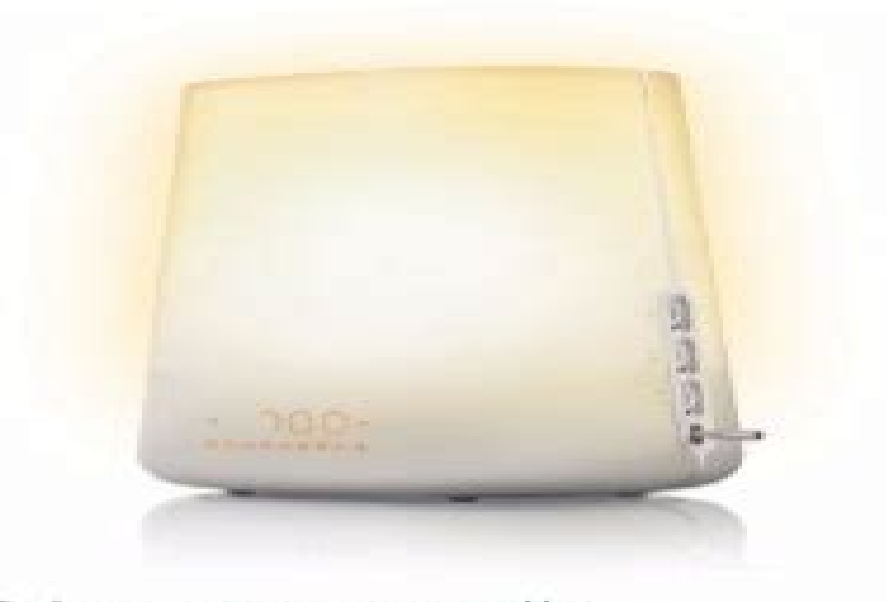
Philips Wake-up Light