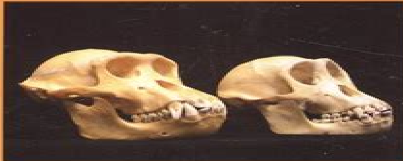
Male and Female Chimpanzee