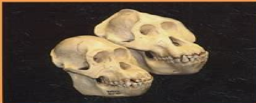
Female and Male Orangutan