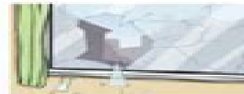
breaking a window