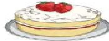
baking a cake