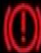
Brake system warning light