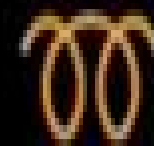
Glow plug indicator light