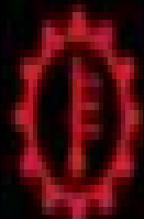
Automatic transmission fluid temperature