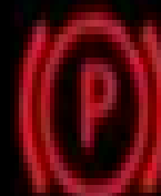
Parking brake warning light