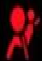
SRS airbag warning light