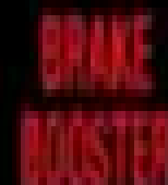
Brake booster warning light