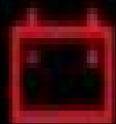
Generator warning light