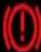
Air pressure warning light