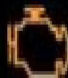
Check engine warning light