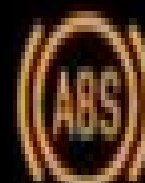
ABS warning light