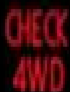
Check 4WD warning light