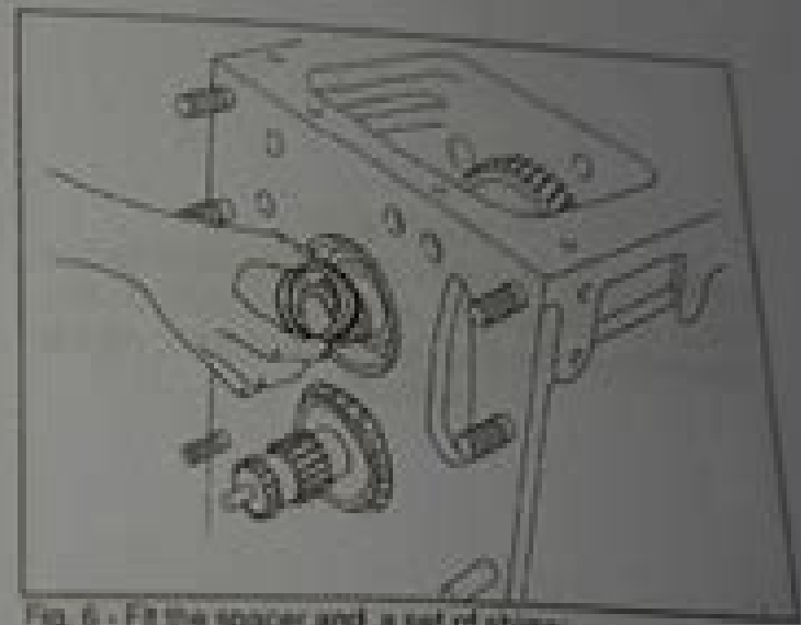
Fig. 6 - Fit the spacer and a set of shims;