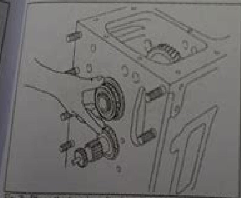
Fig. 7 - Place the bearing after installing the external lock ring into the gearbox;