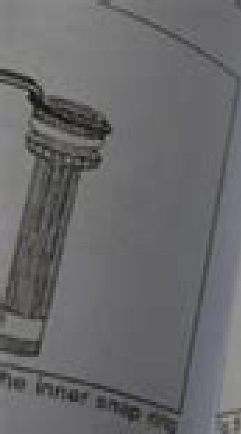
the inner snap ring