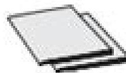
1 x Quick Installation Guide / 1 x GPL License