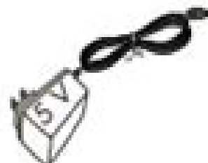
1 x 5V Power Adapter