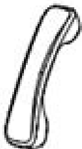
1 x Handset