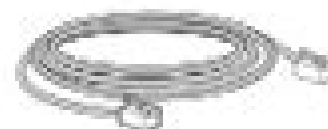
1 x Ethernet Cable