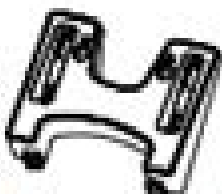
1 x Phone Stand