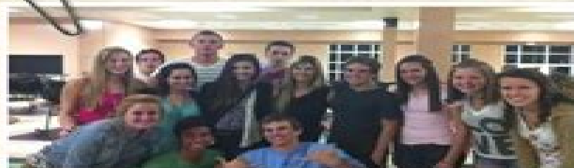
After sharing the good news with some of the Timber Creek High School students.

Speaking at the Student Venture meeting at Timber Creek High School was a really neat experience God provided for me. It was my first time sharing the gospel with American high schoolers. In the Philippines the blonde hair and white skin grabs the kids attention immediately but I wasn't sure what was going to be the best way to approach American teens... how to keep their attention and have them hear God's message. But, I put my faith in the Holy Spirit and once again, God pulled through. I know had I walked out in front of the high school students on my own merit I would have fumbled... but with the Holy Spirit, God gave me the words and means to keep the students attention! Not only that but He had them hear His message. These talks aren't about me, I don't really even matter. All that matters is that I trust and invite the Holy Spirit to do the talk for me. I'd love to say I am a fine speaker but the truth is, I'm not. There is nothing special about me except that I invite the Holy spirit in and then trust Him. I pray today we all have the Holy Spirit dwelling inside us and daily call upon Him!