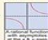
A rational function with asymptotes at x = 0 & y = 0 .

The branches of rational functions approach asymptotes.