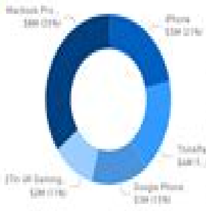
Sales by Product

-MacBook pro is top contributor for total sales followed by iPhone 31% of total sales from Apple product