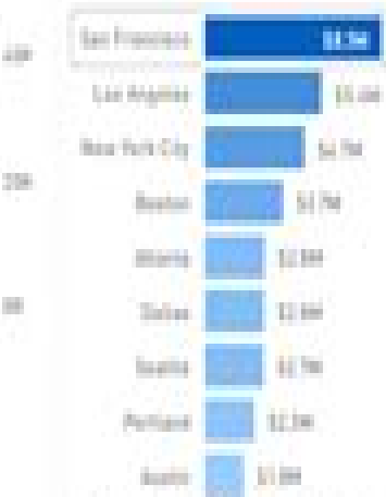
Sales by City

-Top city by sales San Francisco $4.5M (13% of total sales)