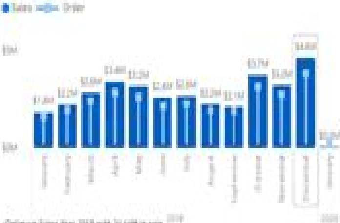
Sales by Month

-Optimum Sales Year 2019 with 34.47M in sales -Optimum Sales Month Dec-2019 with 3.5M sales (10.15% of total sales) -Dec-2019 sales are more as year ending company running with special discount and offers