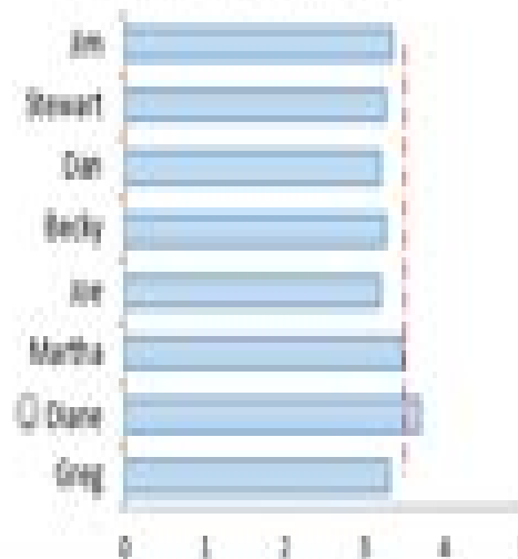
Satisfaction Score - By Agent