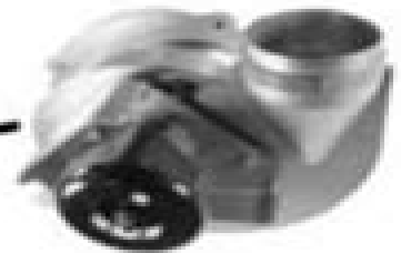
Draft Inducer Motor