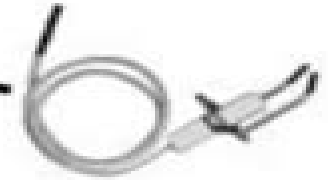
Direct Spark Ignitor