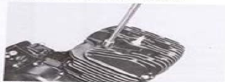
Fig. 9. Loosen cylinder head nuts sequentially, loosening each nut just a little at a time, and take off the head.