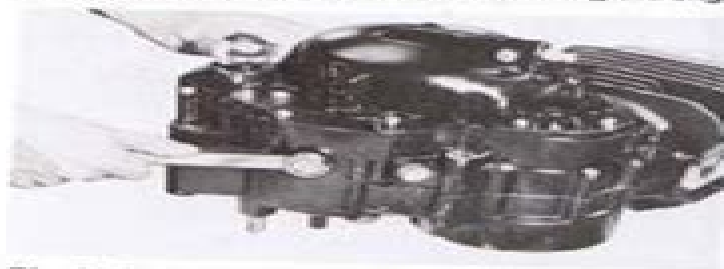
Fig. 8. Remove oil drain plug and let out oil.

The sequence of steps for disassembling the engine taken down from the chassis is as follows: